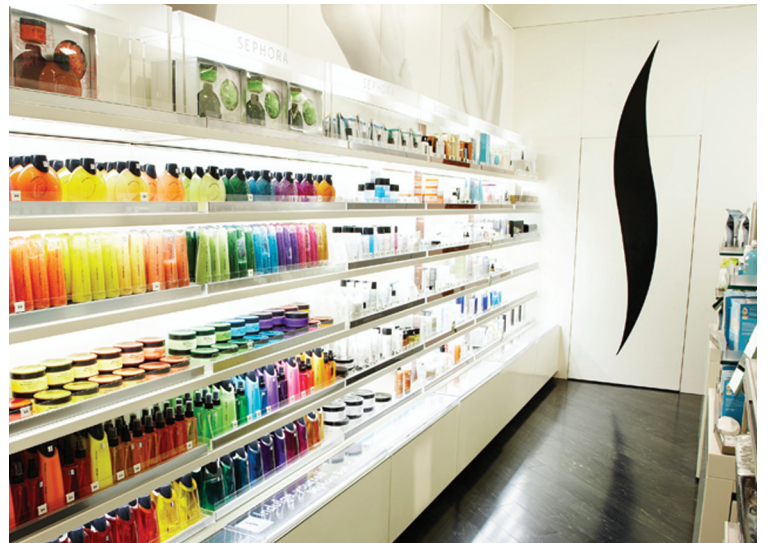
A glimpse into the number of products found in Sephora.