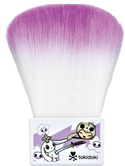
The kabuki brush from the tokidoki line, exclusive to Sephora.